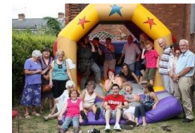
Children and adults worship together and have fun...

Children are always welcome here and we are currently building a great relationship with Even Swindon School, who come to the church on a regular basis. Junior Church meets during the main Sunday service. We are currently looking at introducing new young people's activities, so visit our website regularly for more information. Brownies and Guides meet in the Parish Room on Tuesdays at 6.30pm during term time.