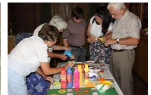
...often being creative and colourful!