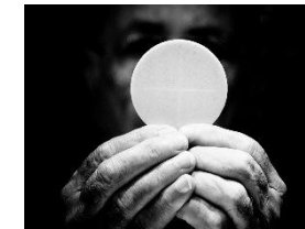
Christ feeds us in Word and sacrament

Our Sunday services begin at 11am, offering a varied but relevant approach to worship. There are three communion services in most months and an interactive all age service. On the Third Sunday of each month, we unite for worship with Rodbourne Methodist Church - a relationship stretching back almost 40 years. Our monthly fellowship group, fellowship@9 meets on the fourth Sunday at 9am for breakfast and discussion.