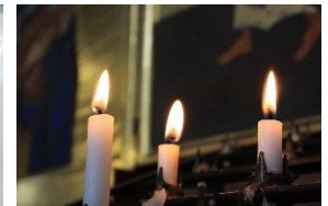
...and light a candle and say a prayer