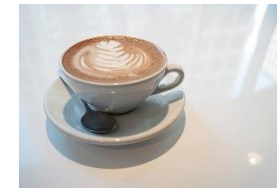
Come and have a cup of tea and a chat...

There is a communion service at 10am every Wednesday and Morning Prayer at 8am every Tuesday and Saturday. On the Second Monday of every month there is a meditation service at 7.30pm. The Church is always open on a Saturday morning for visiting and for private prayer. Feel free to come in and light a candle and then have a 'cuppa and a chat' with church members. All are welcome.